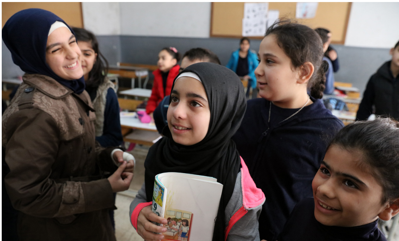
Students at the Second Bourj Hammoud Public School listen to their teacher while in class in Beirut, Lebanon on March 23, 2016.

renewed authoritarianism took hold, the United States largely acquiesced.