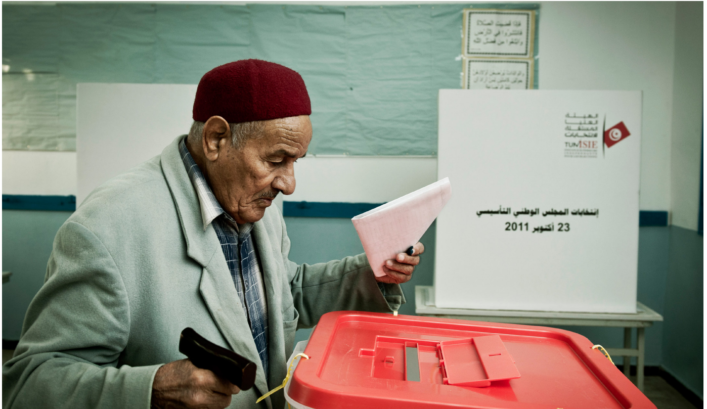
At the invitation of the Tunisian interim government, the European Union established an Election Observation Mission to monitor the elections for a Constituent Assembly, October 23, 2011.

their country from too much external interference by rejecting any role as a “model” for other Arab states, instead insisting on their own specificity. Tunisia’s military was not a political force under Ben Ali, and unlike Egypt’s military, it has embraced civilian control. Finally, while Tunisia has suffered some significant assassinations and terrorist attacks, it has not thus far become a concerted focus for regional jihadist efforts (although for reasons not fully understood, Tunisia has produced a disproportionately large number of ISIS recruits going to Syria).