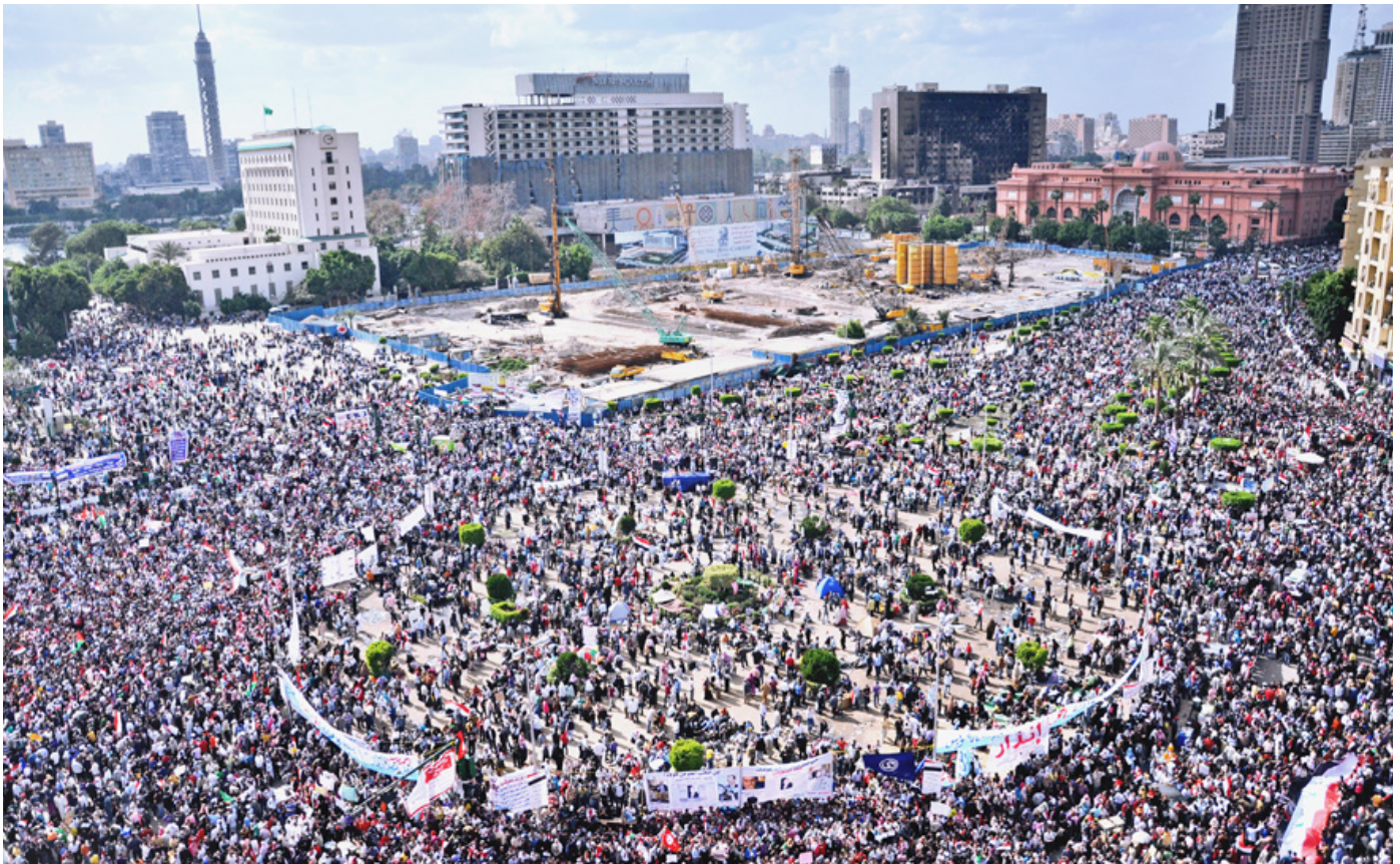
Protestors filled Tahrir Square in Cairo, Egypt on April 8, 2011.

The corporatist systems of Arab autocracy, sustained by rents, ideology, and occasional coercion, were challenged at the end of the twentieth century by the emergence of three major forces: a massive demographic bulge of young people on the cusp of adulthood; the push and pull of local economic stagnation and global economic integration; and a radically new information environment generated first by satellite television and then by the Internet and mobile technology. These forces, in combination, fatally undermined the ability of the region's governments to deploy ideology, rent-based patronage, and selective coercion to maintain consent for their rule.