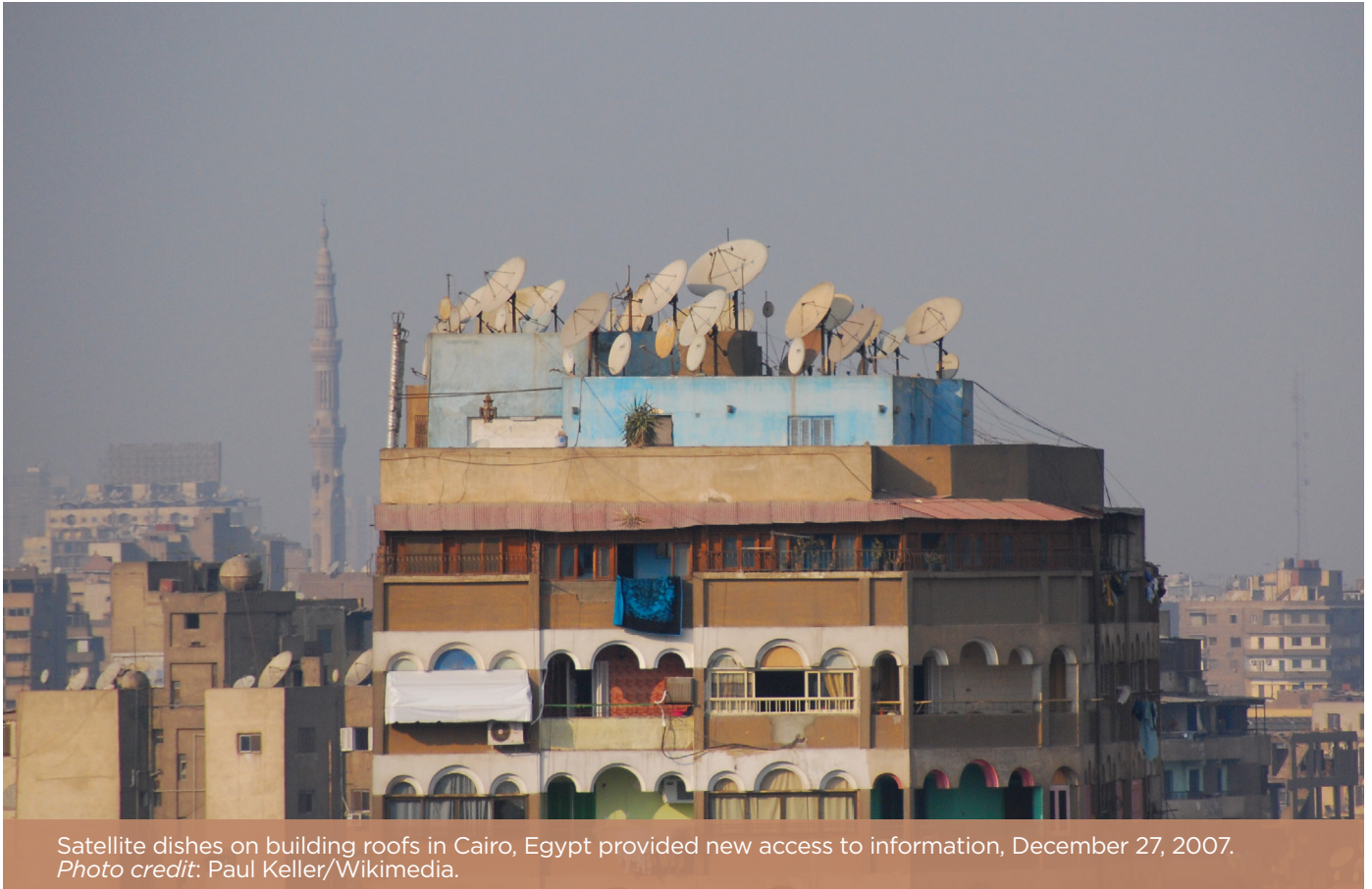
Satellite dishes on building roofs in Cairo, Egypt provided new access to information, December 27, 2007.

Perhaps it was inevitable that in this context of limited political and economic reforms determined by, and largely benefiting, a narrow slice of the society, the Arab world would see the emergence of new forms of bottom-up formal and informal political mobilization in the form of grassroots protest movements, new labor unions and wildcat labor actions, and new political parties, as well as new mobilization within and recruitment to long-standing non-state movements like the Muslim Brotherhood and Salafi groups.