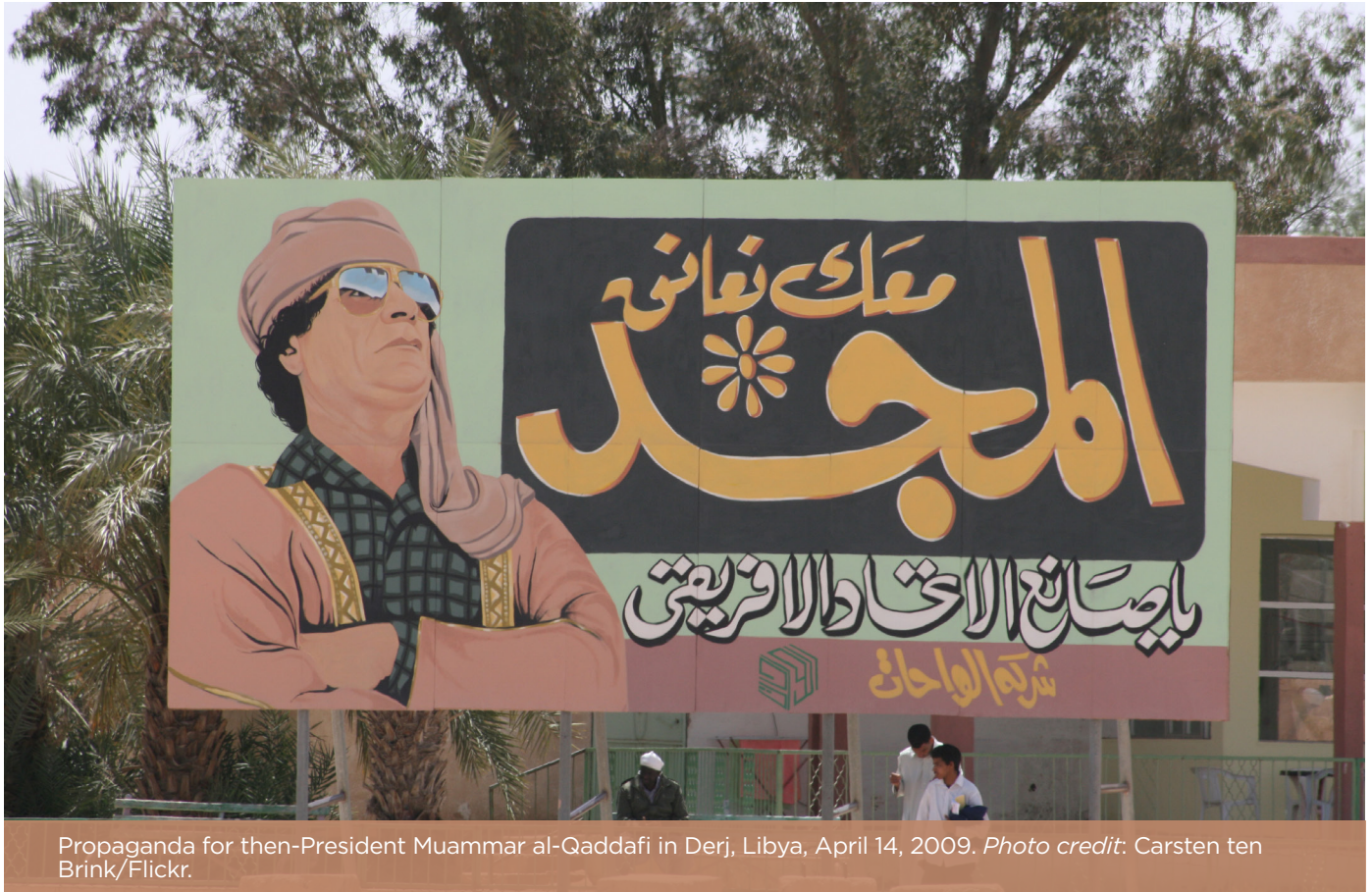
Propaganda for then-President Muammar al-Qaddafi in Derj, Libya, April 14, 2009.

outside actors as the best available means to shore up the region.