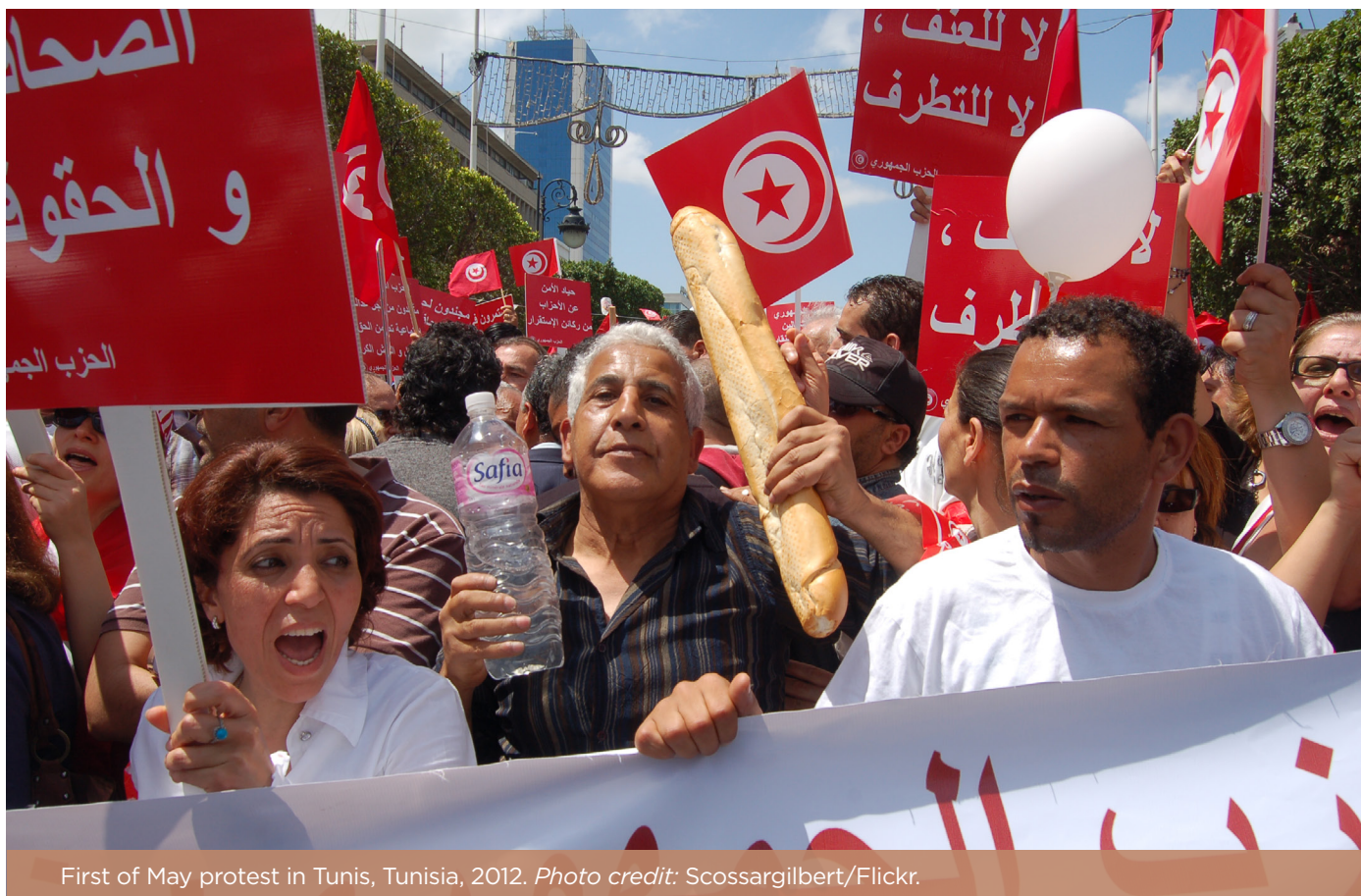
First of May protest in Tunis, Tunisia, 2012.

finding fodder for damaging accusations, or to prevent political opponents from gaining a foothold. Such constraints on information hold back social trust and progress in general, but are even more pernicious in the current disordered environment. Government opacity breeds suspicion and cynicism about government behavior, exacerbating the problems of order and authority that are already challenging governance. Sustainable governance requires regimes to adjust to the reality of an information environment they cannot control, listen to public demands for participation, and abide by the demand for accountability. Durable governments will proactively open themselves to public scrutiny, as well as to public input and assessment of their performance; while this may increase complaints and demands, it also spurs more responsive and effective policies and practices.